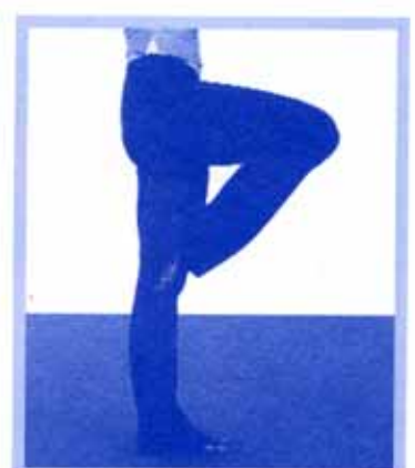
Passé parallel or jazz passé pointed foot, arch placed against the inner curve of the knee