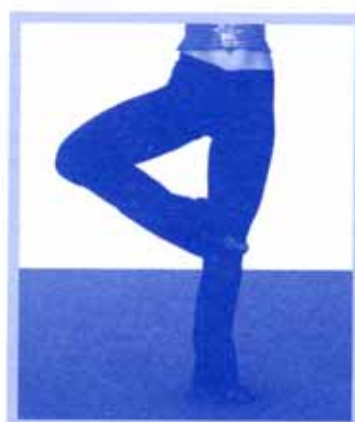
Ballet passé turned out position; pointed foot, cupping the front of the knee