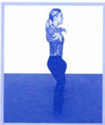
Plié (Correct) to Bend side view - correct position; hips under, knees directly over toes, turned out 2nd position

* 1ST AND 2ND POSITION CAN BE PERFORMED IN PARALLEL