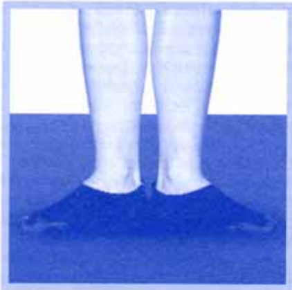
1st position *