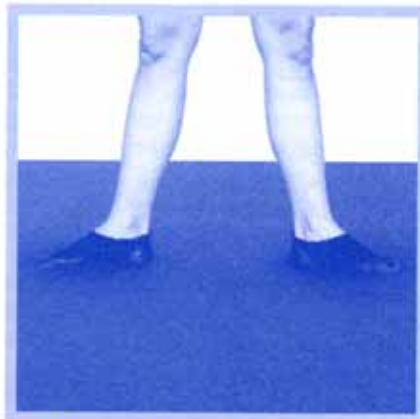
2nd position *